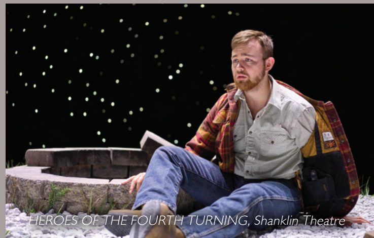
HEROES OF THE FOURTH TURNING, Shanklin Theatre

UE Theatre productions provide purposeful experiences tailored to challenge and cultivate growth in an individual student's path as a theatre artist. Students have the opportunity to work in all three venues: the 482-seat Shanklin Theatre, the versatile May Studio Theatre, and the newly created John David Lutz Theatre Lab.