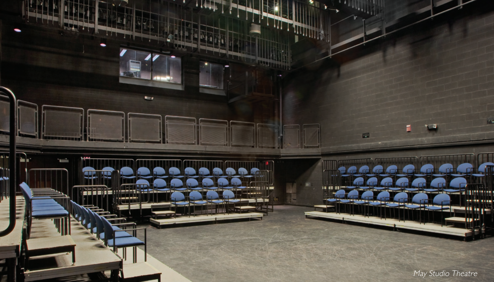
May Studio Theatre