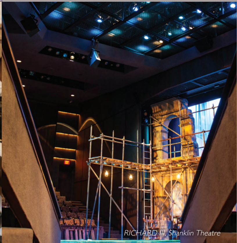
RICHARD III, Shanklin Theatre