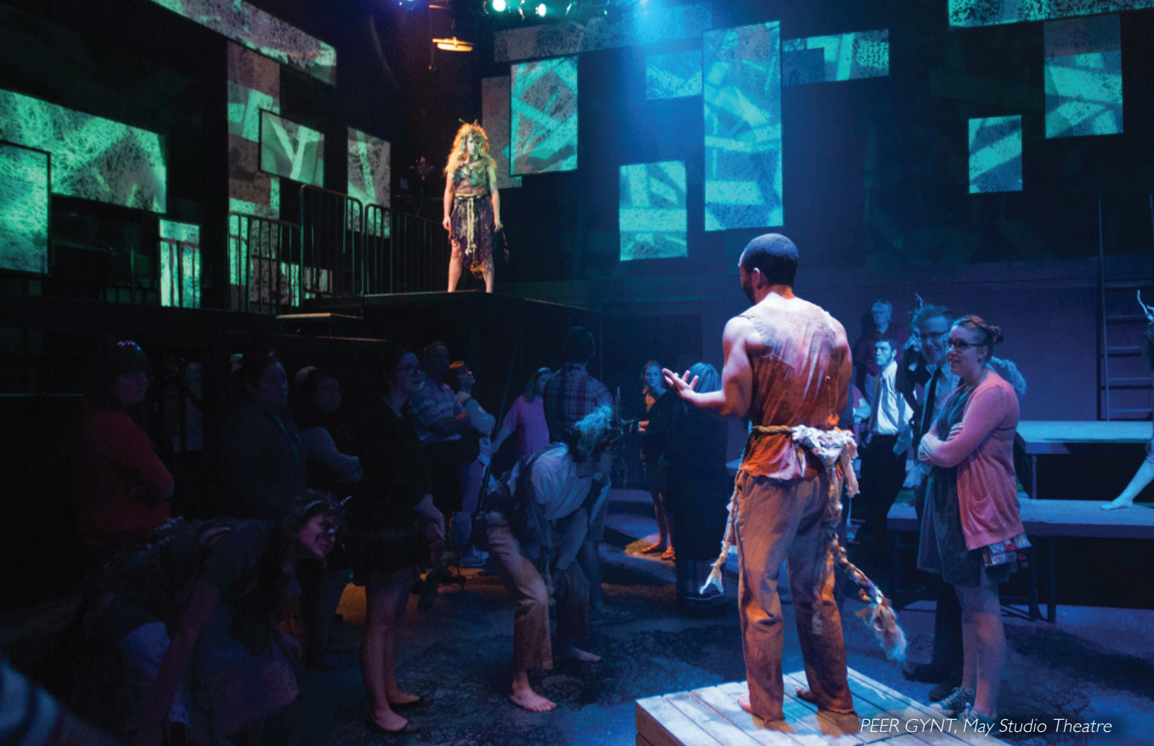
PEER GYNT, May Studio Theatre